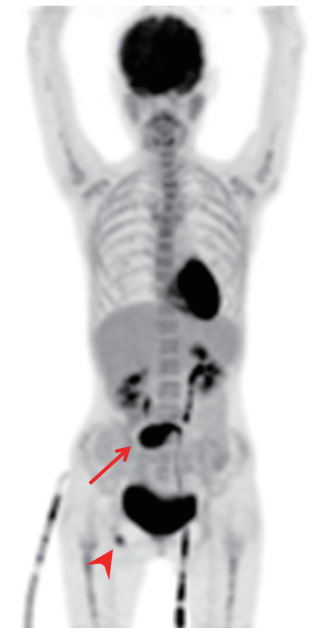
Fig. 3. Maximal intensity projection FDG PET/CT scan. PET/CT images were acquired after locking the percutaneous drainage tube. Similar to the renal scintigraphy images, radioactivity is retained in the urine from the renal pelvis to the mid-ureter level in both kidneys. Radioactivity is also detected in the urine in the cystic mass lesion (arrow). The focal FDG activity of the right pubic bone (arrowhead) indicates a traumatic change.

plete resection of the desmoid tumor with negative microscopic resection margins is the standard goal (1). However, many clinicians are reluctant to perform a surgical resection because of the high recurrence rate. Moreover, the surgical trauma could cause a recurrence by itself (7-9). Complete surgical resection of an in-