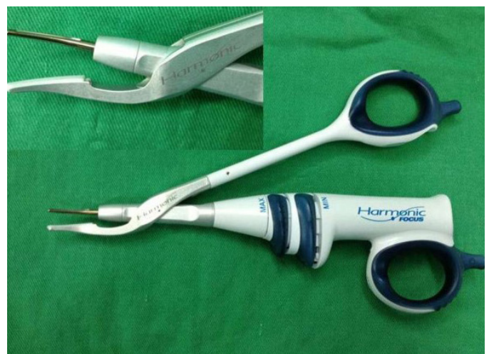
Fig. 1. The appearance of a Harmonic scalpel (Ethicon Endo-Surgery Inc., Cincinnati, OH, USA). It is an ultrasound resection method that enables hemostasis at the same time as tissue resection by using high-frequency mechanical vibrations ranging from 20,000 Hz to 60,000 Hz.

Drainage amount was calculated only from the two drains in the back donor site. We defined seroma formation as fluid collection