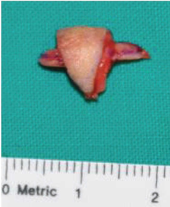
Fig. 1. Cartilage harvested from the helical rim had a horizontal length of about 15 mm and a vertical length of about 7 to 8 mm. We obtained 2 limbs of proper soft tissue and 2 limbs of cartilage.

The composite graft was inserted into the soft-triangle defect in