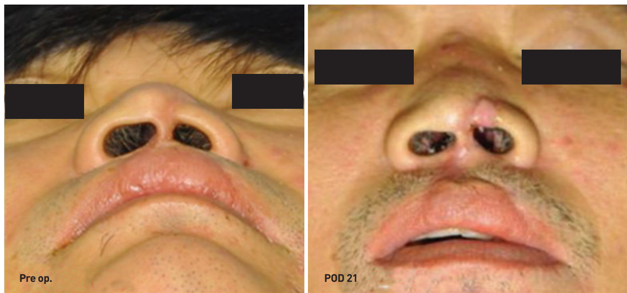
Fig. 5. Change of left nostril lining in a worm's eye view during the follow-up period. OP, operation; POD, post operative days.

graft was gently harvested from the ipsilateral auricular middle helix area.