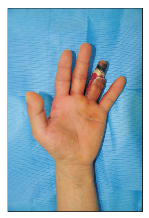
Fig. 1. Ischemic necrosis of left 4th finger was shown.

But ischemic necrosis with complete demarcation at distal interphalangeal joint level and infection occurred with loss of sensitivity because of severe soft tissue injury with neurovascular damage including common digital artery (Fig. 1). So we considered amputation for ischemic digit, but the patient strongly expected salvage operation. Then we planned 10×5 cm sized ALT free flap coverage for reconstruction. In harvesting pedicles, a selected perforator which had largest diameter and both end of the descending branch of lateral circmuflex femoral artery (D-LCFA) and two venae comitantes (VC1, VC2) formed T-shape pedicle. After flap insetting, harvested T-shaped arterial pedicle was interpositioned between each end of the divided superficial palmar arch (SPA). And proximal and distal end of D-LCFA were anastomosed to proximal and distal end of SPA by T-anastomosis to rebuild deficient vascular flow. In venous anastomosis, proximal end of VC1 and VC2 of flap were anastomosed to proximal end of dorsal metacarpal vein (DMV) and proximal end of VC1 of SPA. Distal end of VC1 of flap were anastomosed to distal end of VC1 of SPA (Fig. 2).