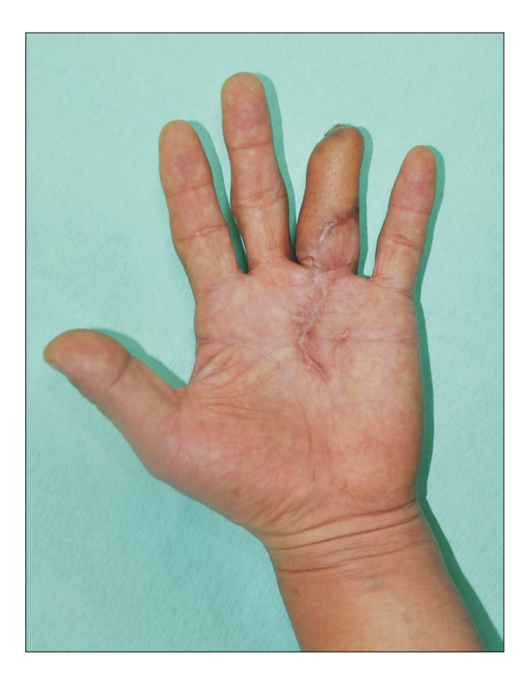
Fig. 3. In postoperative finding after debulking procedure (6 months), the flaps survived well and there were no notable complications.