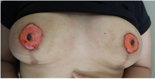
DOI: 10.12998/wjcc.v10.i34.12781 Copyright ©The Author(s) 2022.

Figure 1 Initial Photograph of both nipple areolar complex. Scars were seen on both peri-areolar areas and lower pole of the breast after the breast reduction operation. Pinpoint bleeding was found in both areolar areas. The size of the nipple areolar complex (NAC) on the right side appeared larger than that of the NAC on the left side. The nipples remained dark brown in color because tattoos were not performed on that area and they did not match the color of the areolar area. Hypopigmentation was seen in both areolar areas.