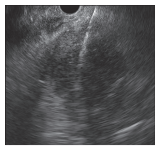
Figure 2. Endoscopic ultrasound-guided fine needle biopsy (EUS-FNB) of pancreas' body mass and subcarinal lymph node