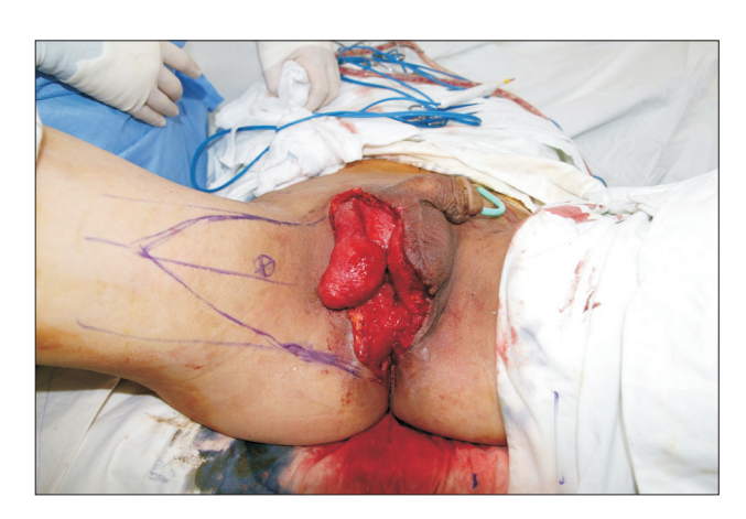
Fig. 2. A 48-year-old male with scrotal and perineal defects due to Fournier's gangrene. Using handheld Doppler, we marked the blue circle meaning the perforator of medial femoral circumflex artery and designed V-Y pattern fasciocutaneos flap for reconstruction.

the thigh was used, with dissection in the fasciocutaneous plane and evidencing the gracilis muscle throughout the bed, without direct handling. Under using microscope, the perforator of MFCA to skin flap which runs deep between the adductor magnus and longus was found and preserved (Fig. 3, 4). The patency of the vessel was well. After flap inset, two hemovac were inserted and flap was repair with No.4-0 Nylon. The donor area was submitted to primary closure, by planes. Ten days postoperatively, the patient experienced no complication within adequate functional and aesthetic results (Fig. 5).