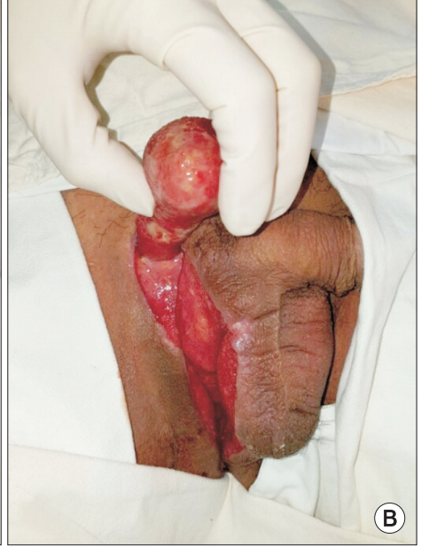
Fig. 1. A 48-year-old male with scrotal and perineal defects due to Fournier's gangrene. (A) Post-opertive periods: 21 days of debridement and negative-pressure wound therapy (B) right unilateral testis totally was exposed.