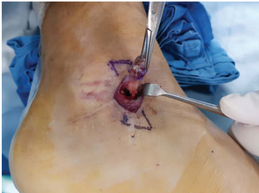
Figure 6. The chronically infected sinus tract was excised.

wound dehiscence was evident. No bacterium grew on wound culture; the pathological diagnosis was chronic inflammation and abscess formation. He visited our outpatient clinic for scheduled follow-up at 12 months after surgery. The wound had completely healed (Fig. 12). He reported no symptoms of infection and regained full function of the right ankle. The anterior drawer test was negative. The AOFAS Ankle-Hind Foot score improved to 90.