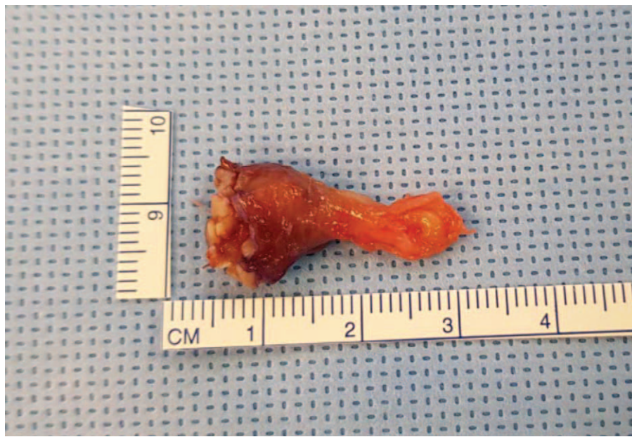
Figure 7. The sinus tract; pathological examination.