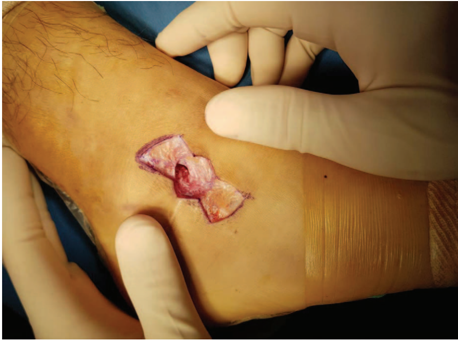
Figure 9. Rectangular skin flaps were created superior and inferior to the wound.

complications associated with suture anchor use during ankle surgery have been rarely reported.