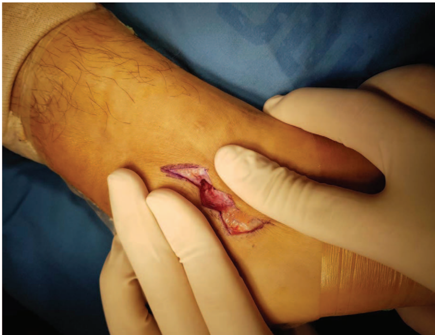
Figure 10. The anterior flap was lowered and the posterior flap raised to create a zigzag-shaped wound.

A few reports have described the incidence and management of culture-negative infections developing after orthopedic surgery. Such infections arise after prior antibiotic treatment to counter infections with unusual organisms such as fungi, mycobacteria, or bacteria that form biofilms. Two case reports have