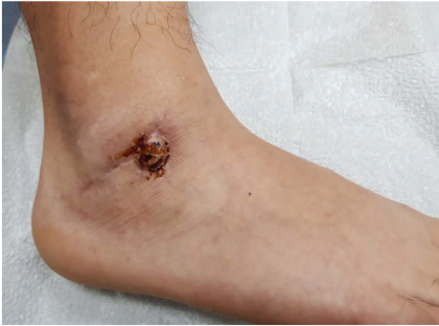
Figure 1. A 1.5 × 2-cm-sized ulcerative wound accompanied by a red-black discharge on the anterior border of the right lateral malleolus.

simple suture was placed. There was no evidence of wound infection, and the suture was removed and the patient discharged. However, abrupt wound discharge and dehiscence developed after suture removal. He did not visit that hospital again, for personal reasons, and personally dressed the chronic wound at home. He visited our outpatient clinic 1 year later.