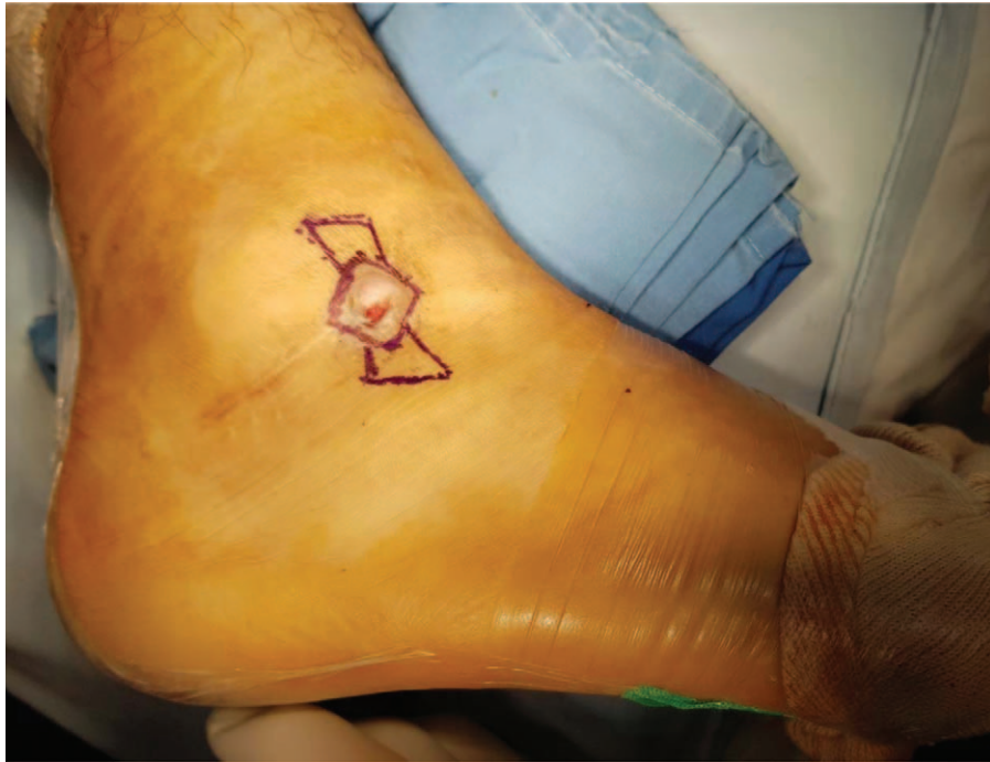
Figure 3. A rectangular skin incisions encompassing the ulcerative wound was created, followed by dissection along the chronically infected sinus tract.

(AOFAS) Ankle-Hind Foot score was 45. Intravenous vancomycin was commenced on the day of surgery.