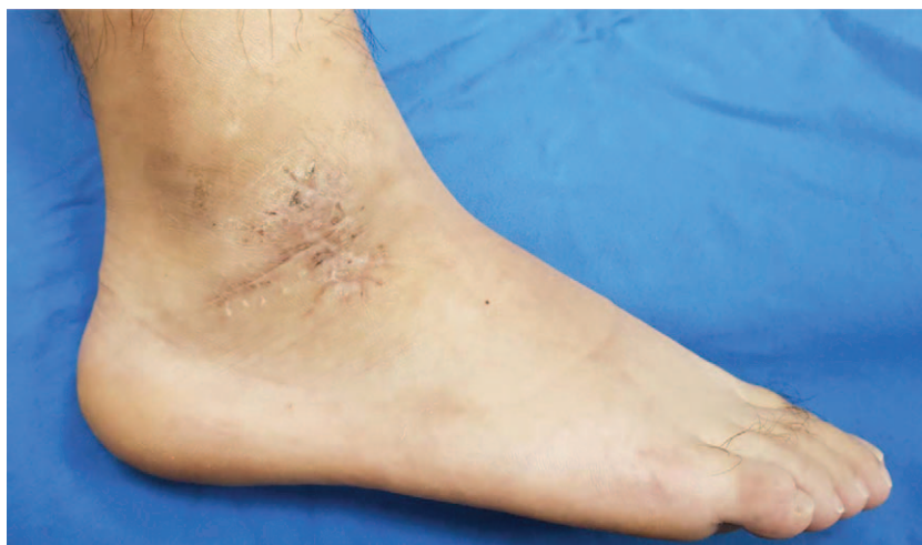
Figure 12. The wound exhibited no complication or recurrence of infection at the 1-year follow-up exam.