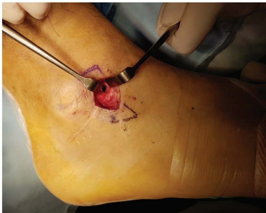
Figure 8. A hole through the sinus tarsi was evident at the wound site.

lateral ankle ligaments; the success rate is 85% to 90%. [8-10] Suture anchors were developed to facilitate soft tissue fixation to bone, and have been placed during both open and arthroscopic MBOs. [1-3,11,12] Such placement is technically simple and allows accurate ligament re-attachment to the normal anatomical origins. [1] However, suture anchors, being implants, can cause problems. [5,13,14] Reported complications associated with suture anchor used in shoulder surgery include pull-out, [5,15] arthritis, [5-7] and osteolysis. [7,16] To the best of our knowledge,