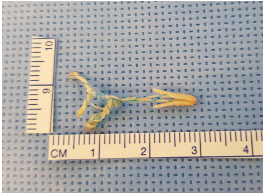
Figure 5. The removed suture anchor.

rectangular superior and inferior skin flaps (Fig. 9). The anterior flap was lowered and the posterior flap raised to create a zigzag-shaped wound (Fig. 10). After simple suturing, a short leg cast was applied and the wound dressed through the cast window (Fig. 11). The patient received intravenous vancomycin during 14 days of hospitalization. He was discharged on postoperative day 14 with a 1-week prescription of oral amoxicillin/clavulanic acid. At 4 weeks postoperatively, we removed the suture and cast; no