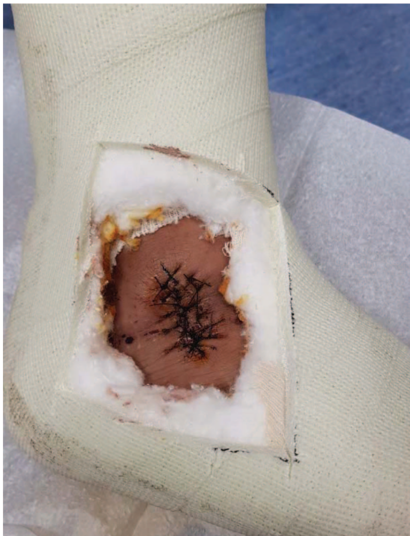
Figure 11. After simple suturing, a short leg cast was applied and the wound dressed through the cast window.