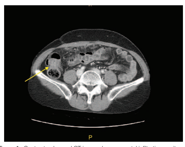
Figure 1. Contrast-enhanced CT image shows omental infiltration, peritoneal thickening, and ascending colon wall thickening. CT = computed tomography.

Menarche was at age 16. Her surgical history included appendectomy 30 years previously and 2 Cesarean sections. She had no other relevant family history. Her general health was favorable with no specific findings during routine health screening 1 year earlier. She complained of urinary frequency and abdominal pain and had undergone treatment for suspected chronic pelvic inflammatory disease and cystitis in our hospital. At the time of admission, her systemic status was good with no apparent abnormalities. Her height was 144 cm, weight 45 kg, blood pressure 100/60 mmHg, heart rate 72 beats/min, respiratory rate 18 breaths/min, and body temperature 36.5 °C. No tenderness or rebound tenderness was observed on abdominal palpitation, and no specific symptoms were manifested excluding cervical motion tenderness on pelvic examination. Transvaginal ultrasonography revealed a 3 cm cystic mass in the left ovary with relatively clear margins and an irregular solid portion partially observed within the mass. Drug therapy (metronidazole and doxycycline for 14 days) was initiated to manage suspected pelvic inflammatory disease or a tubo-ovarian abscess. An abdomenpelvis CT scan and blood and urine tests were performed, as the patient's abdominal discomfort persisted.