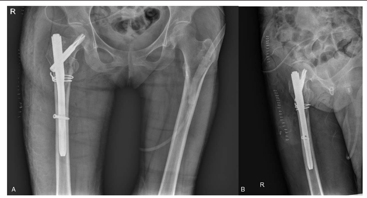
Figure 4. Postoperative anteroposterior and lateral radiographs of the right hip showing osteosynthesis with proximal femoral nail antirotation (PFNA) and wiring.

weeks later, the patient returned to everyday life and reported mild pain at the operation site. Plain radiography at the 6-month follow-up showed complete union of the intertrochanteric fracture (Fig. 5), and gradual advancement to full activity was achieved. She had no complications or recurrence of symptoms at the 1-year follow-up. However, on DXA scan, the T score showed values of -3.4 in the hip and -4.2 at the lumbar level, indicating that she had not fully recovered from osteoporosis.