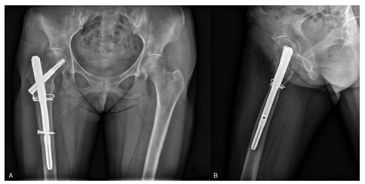
Figure 5. Six-month follow-up images showing complete union of the fracture site and absence of specific complications, such as nonunion and malunion.

To our knowledge, this is the first report of a case of femoral intertrochanteric fracture in a young woman following recovery from anorexia nervosa. At the time of presentation, our patient's BMI had returned to normal (19.53\,\mathrm{kg/m^2}) and she also had menstrual periods. However, analysis of BMD at the time of presentation showed T scores of -3.0 in the hip and -3.6 at the lumbar level, indicating that the patient still had osteoporosis