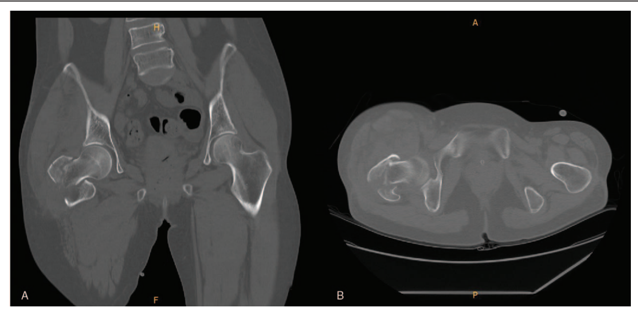
Figure 2. Computed tomography of the hip demonstrating femoral intertrochanteric fracture.