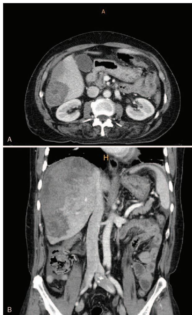
Figure 1. Computed tomography showed a hypodense mass in segment VI of the right hepatic lobe. There is no pneumoperitoneum.

Three days after the patient was admitted to the hospital, his fever subsided, and his white blood cell count was normalized, but severe abdominal pain persisted.