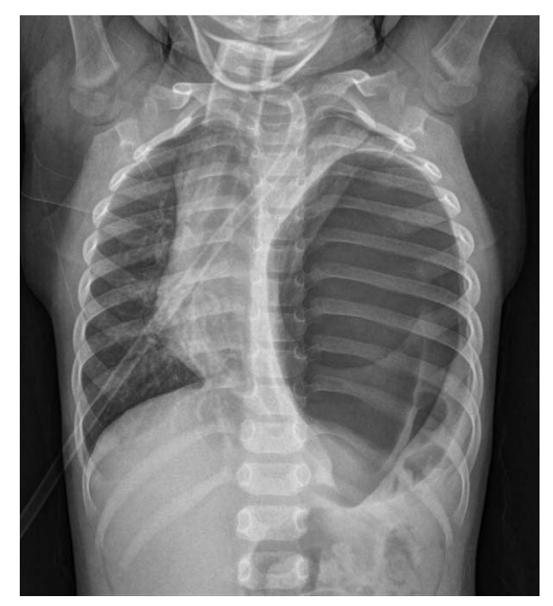
Figure 1. Chest x-ray showing air shadowing filling the entire left thorax and mediastinum shifting.

with reduced breath sounds on the left side. The white blood cell count was elevated at 38,450/uL, and his chest x-ray showed air shadowing in the whole left thorax and mediastinal shift (Fig. 1).