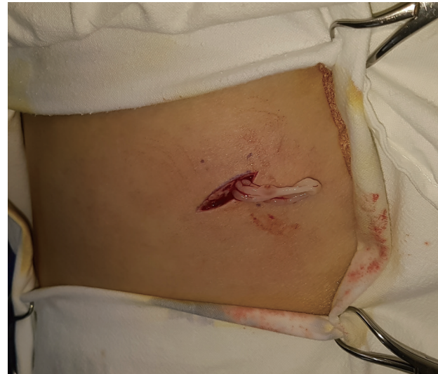
Fig. 3. As an incision was being made, a suspected parasite emerged from the underneath the incision area.

A 35-year-old woman presented to our clinic with an asymptomatic nodule on her abdomen that had been detected a few weeks previously. Physical examination revealed a solitary, moveable subcutaneous nodule, approximately 4 cm in diameter, and we suspected a lipoma. While performing an excisional biopsy of the lesion and while the incision was being made, a parasite emerged through the incision (Fig. 3). A 24 cm sized white, flat parasite emerged that was contracting and moving its body, and it was removed (Fig. 4). A histopathological study confirmed the parasite was a sparganum. Following surgery, our patient has had no complications. She denied consuming snake flesh or any kind of relevant high-risk food