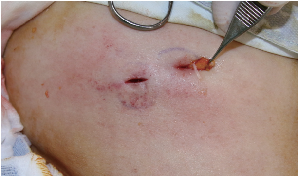
Fig. 1. Intraoperatively, no pathologic findings were observed within the subcutaneous layer; however, a white-lined mass was identified.