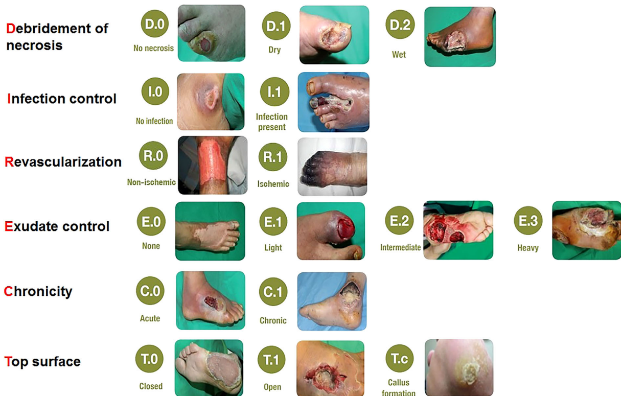
FIGURE 2 Components of the DIRECT coding system

In total, 158 records of patients with DFU were obtained. After excluding patients with dropouts and incomplete clinical databases, 131 patients with DFU were selected for the study.