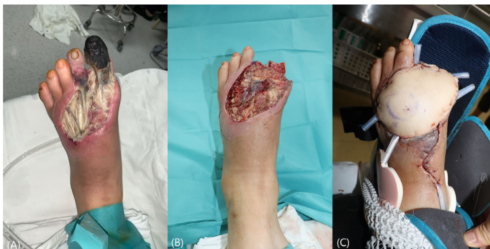
FIGURE 4 Clinical application of DIRECT coding system. A, DFU of the left foot with necrotic tissue in a 61-year-old male. The patient was diagnosed with diabetes and hypertension 20 years ago. According to the DIRECT1 coding system, D2 I1 R1 E3 C1 T1 can be assigned, and a total of 9 points corresponds to a high risk of amputation. On the DIRECT2 system, the result was 2.173, which strongly suggested amputation ( -6.206 + 0.526 \times 1 + 2.108 \times 1 + 2.507 \times 1 + 0.186 \times 3 + 0.126 \times 1 + 2.554 \times 1 = 2.173 ). According to the DIRECT3 system, the most highest value was 3.251, and in the end, amputation was performed. ( -8.107 + 0.603 \times 1 + 1.952 \times 1 + 2.267 \times 1 + 0.107 \times 3 + 0.322 \times 1 + 2.448 \times 1 + 0.315 \times \log[27.987 \text{ mg/dL}] + 0.841 \times 1 + 1.518 \times 1 = 3.251 ). B, Dirty granulation tissue was observed even after debridement and great and second toe amputation. Therefore, angioplasty was performed according to the algorithm of the DIRECT coding system. C, After angioplasty, anterolateral thigh free flap was performed, and limb salvage was successfully performed on 7th day of post-operative days